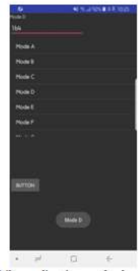
Fig. 3 Enter serial number in mobile application and select setting information and transmit.